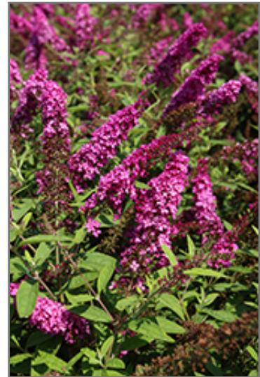
Lo & Behold Ruby Chip Butterfly Bush flowers

Lo & Behold Ruby Chip Butterfly Bush is a multi-stemmed deciduous shrub with a mounded form. Its average texture blends into the landscape, but can be balanced by one or two finer or coarser trees or shrubs for an effective composition.