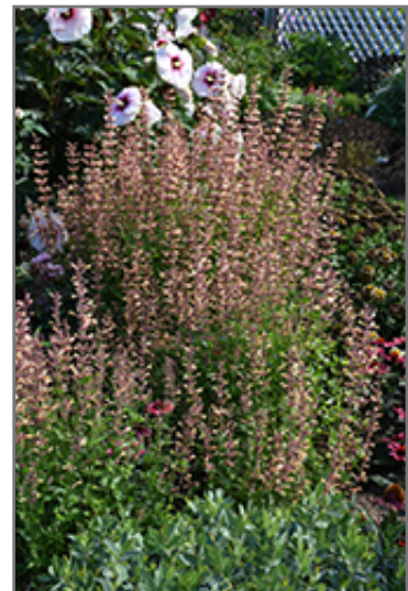
Meant To Bee Queen Nectarine Anise Hyssop in bloom

Meant To Bee Queen Nectarine Anise Hyssop is a fine choice for the garden, but it is also a good selection for planting in outdoor pots and containers. With its upright habit of growth, it is best suited for use as a 'thriller' in the 'spiller-thriller-filler' container combination; plant it near the center of the pot, surrounded by smaller plants and those that spill over the edges. It is even sizeable enough that it can be grown alone in a suitable container. Note that when growing plants in outdoor containers and baskets, they may require more frequent waterings than they would in the yard or garden.