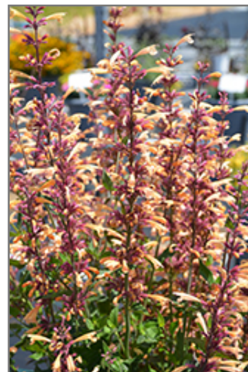
Meant To Bee Queen Nectarine Anise Hyssop flowers

Meant To Bee Queen Nectarine Anise Hyssop is recommended for the following landscape applications;