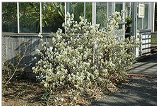
Regent Saskatoon Serviceberry flowers