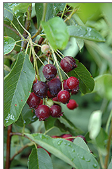
Regent Saskatoon Serviceberry fruit

Regent Saskatoon Serviceberry is blanketed in stunning clusters of white flowers rising above the foliage from early to mid spring before the leaves. It has dark green deciduous foliage. The oval leaves turn an outstanding yellow in the fall. It features an abundance of magnificent blue berries from late spring to early summer.