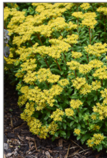
Rock 'N Round Bright Idea Stonecrop in bloom