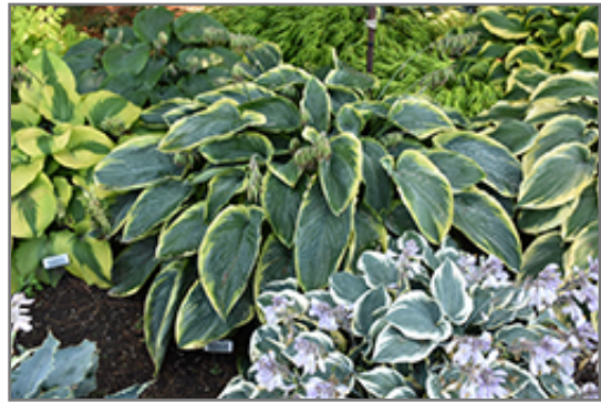
Shadowland Wu-La-La Hosta

This is a relatively low maintenance plant, and is best cleaned up in early spring before it resumes active growth for the season. Gardeners should be aware of the following characteristic(s) that may warrant special consideration;