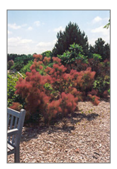
Purple Smoke Tree in bloom