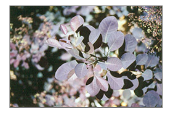
Purple Smoke Tree foliage