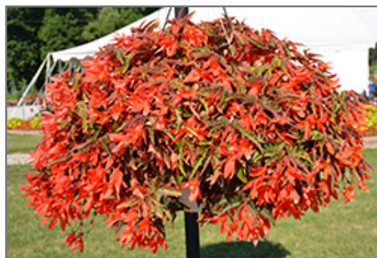
Bossa Nova Night Fever Papaya Begonia in bloom