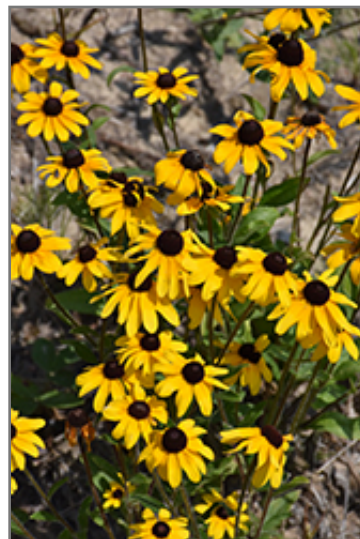
Black-Eyed Susan (Native) flowers