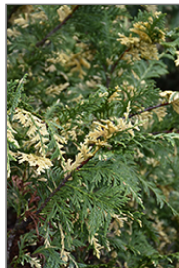
Variegated Nootka Cypress foliage