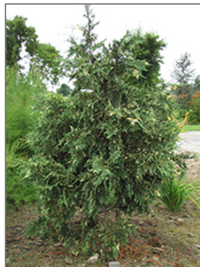
Variegated Nootka Cypress