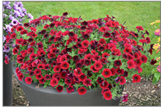
Supertunia Black Cherry Petunia in bloom