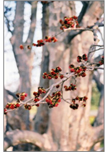
Persian Ironwood flowers

This tree should only be grown in full sunlight. It is very adaptable to both dry and moist locations, and should do just fine under average home landscape conditions. It is not particular as to soil type or pH. It is highly tolerant of urban pollution and will even thrive in inner city environments. This species is not originally from North America.