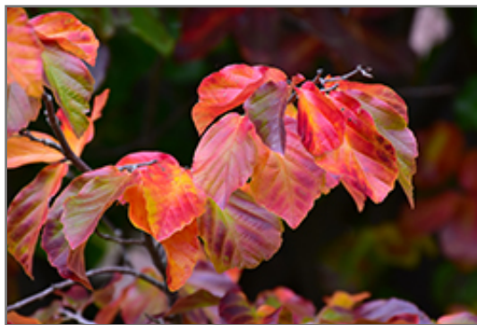
Persian Ironwood in fall