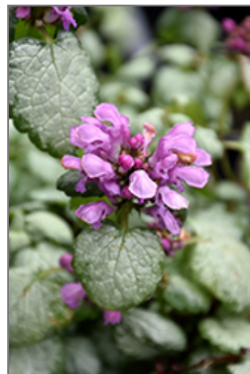
Red Nancy Lamium flowers