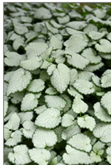
Red Nancy Lamium foliage

Red Nancy Lamium is a fine choice for the garden, but it is also a good selection for planting in outdoor pots and containers. Because of its spreading habit of growth, it is ideally suited for use as a 'spiller' in the 'spiller-thriller-filler' container combination; plant it near the edges where it can spill gracefully over the pot. Note that when growing plants in outdoor containers and baskets, they may require more frequent waterings than they would in the yard or garden.