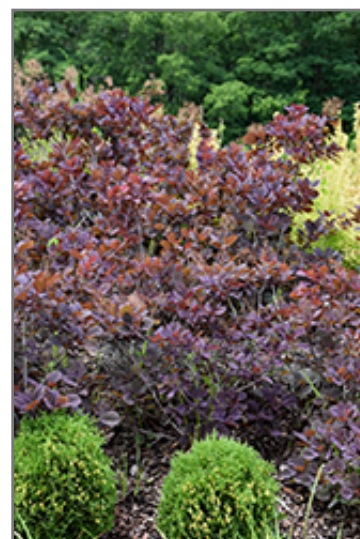
Velveteeny Purple Smokebush