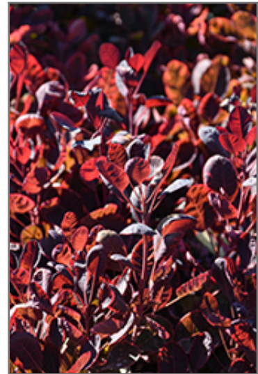
Velveteeny Purple Smokebush foliage

Velveteeny Purple Smokebush makes a fine choice for the outdoor landscape, but it is also well-suited for use in outdoor pots and containers. With its upright habit of growth, it is best suited for use as a 'thriller' in the 'spiller-thriller-filler' container combination; plant it near the center of the pot, surrounded by smaller plants and those that spill over the edges. It is even sizeable enough that it can be grown alone in a suitable container. Note that when grown in a container, it may not perform exactly as indicated on the tag - this is to be expected. Also note that when growing plants in outdoor containers and baskets, they may require more frequent waterings than they would in the yard or garden.