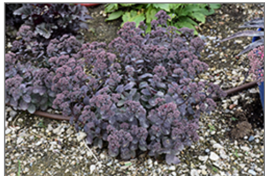
Rock 'N Grow Superstar Sedum in bloom