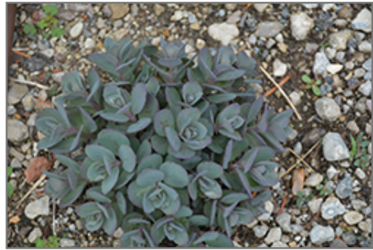
Rock 'N Grow Superstar Sedum