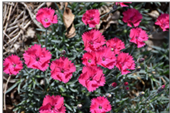
Paint The Town Magenta Dianthus flowers