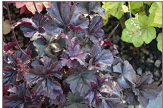
Obsidian Coral Bells foliage