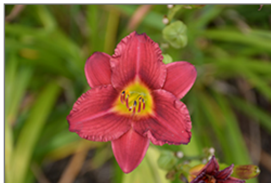
Pardon Me Dwarf Daylily flowers