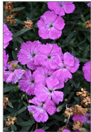
Paint The Town Fuchsia Dianthus flowers

This is a relatively low maintenance plant, and is best cleaned up in early spring before it resumes active growth for the season. It is a good choice for attracting bees and butterflies to your yard, but is not particularly attractive to deer who tend to leave it alone in favor of tastier treats. It has no significant negative characteristics.