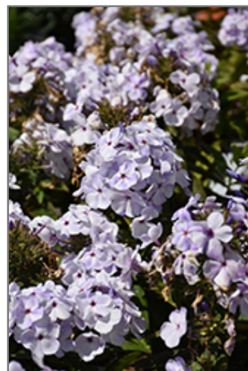
Blue Flame Garden Phlox flowers