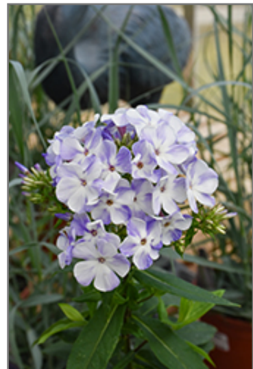
Blue Flame Garden Phlox flowers

Blue Flame Garden Phlox is a fine choice for the garden, but it is also a good selection for planting in outdoor pots and containers. It is often used as a 'filler' in the 'spiller-thriller-filler' container combination, providing a mass of flowers against which the larger thriller plants stand out. Note that when growing plants in outdoor containers and baskets, they may require more frequent waterings than they would in the yard or garden.