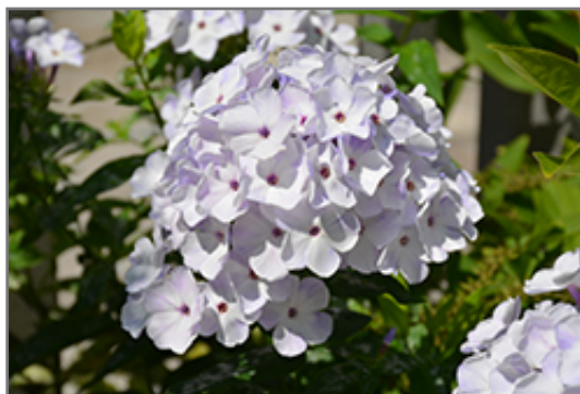
Blue Flame Garden Phlox flowers

Blue Flame Garden Phlox is a dense herbaceous perennial with an upright spreading habit of growth. Its medium texture blends into the garden, but can always be balanced by a couple of finer or coarser plants for an effective composition.