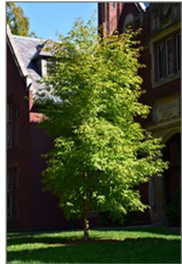
Three Flowered Maple