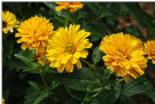
Summer Sun False Sunflower flowers

Summer Sun False Sunflower is recommended for the following landscape applications;