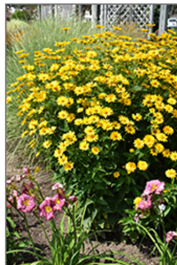
Summer Sun False Sunflower in bloom