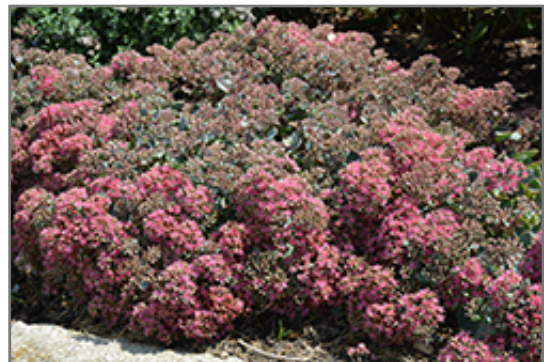
Rock 'N Round Popstar Sedum in bloom