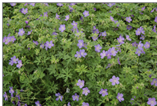
Johnson's Blue Geranium in bloom