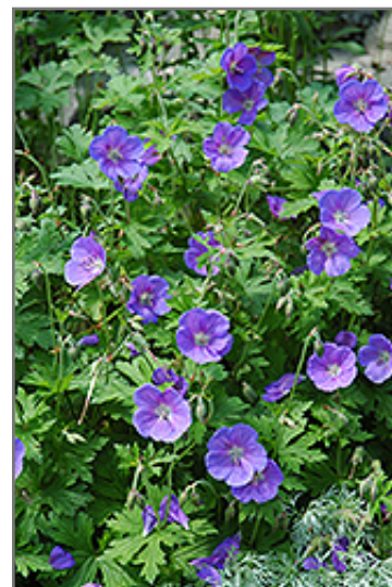
Johnson's Blue Geranium flowers

Johnson's Blue Geranium is recommended for the following landscape applications;