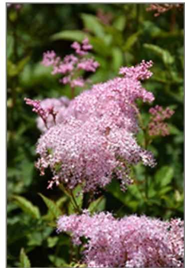
Queen Of The Prairie flowers