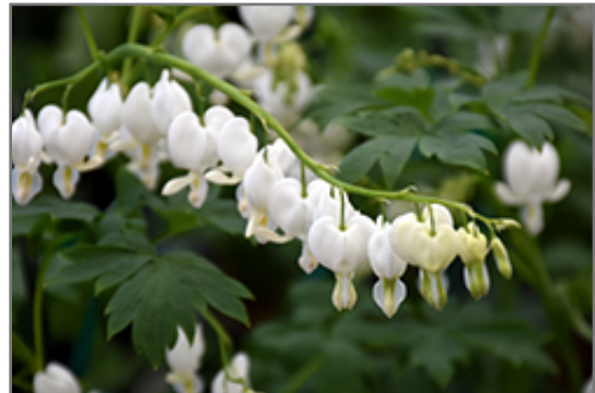
Old Fashion White Bleeding Heart flowers