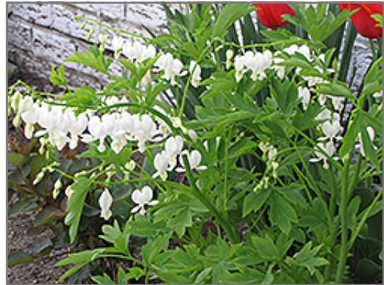
Old Fashion White Bleeding Heart in bloom

This plant does best in partial shade to shade. It prefers to grow in average to moist conditions, and shouldn't be allowed to dry out. It is not particular as to soil pH, but grows best in rich soils. It is somewhat tolerant of urban pollution. Consider applying a thick mulch around the root zone over the growing season to conserve soil moisture. This is a selected variety of a species not originally from North America. It can be propagated by division; however, as a cultivated variety, be aware that it may be subject to certain restrictions or prohibitions on propagation.