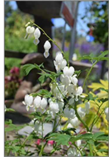
Old Fashion White Bleeding Heart flowers