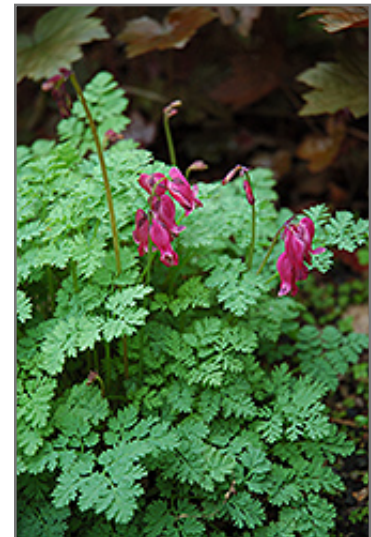
King of Hearts Bleeding Heart in bloom