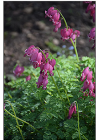
King of Hearts Bleeding Heart flowers

King of Hearts Bleeding Heart is recommended for the following landscape applications;