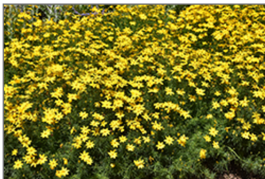
Golden Showers Coreopsis in bloom