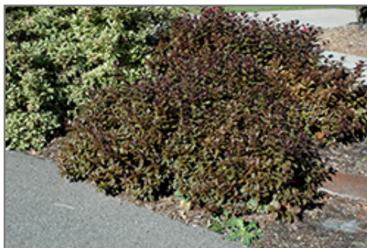
Minor Black Weigela

Minor Black Weigela makes a fine choice for the outdoor landscape, but it is also well-suited for use in outdoor pots and containers. Because of its height, it is often used as a 'thriller' in the 'spiller-thriller-filler' container combination; plant it near the center of the pot, surrounded by smaller plants and those that spill over the edges. It is even sizeable enough that it can be grown alone in a suitable container. Note that when grown in a container, it may not perform exactly as indicated on the tag - this is to be expected. Also note that when growing plants in outdoor containers and baskets, they may require more frequent waterings than they would in the yard or garden.