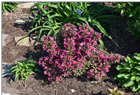
Minor Black Weigela in bloom