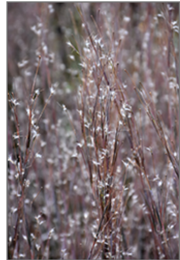
Standing Ovation Bluestem fruit

This plant should only be grown in full sunlight. It is very adaptable to both dry and moist locations, and should do just fine under typical garden conditions. It is considered to be drought-tolerant, and thus makes an ideal choice for a low-water garden or xeriscape application. It is not particular as to soil type or pH. It is somewhat tolerant of urban pollution. This is a selection of a native North American species. It can be propagated by division; however, as a cultivated variety, be aware that it may be subject to certain restrictions or prohibitions on propagation.