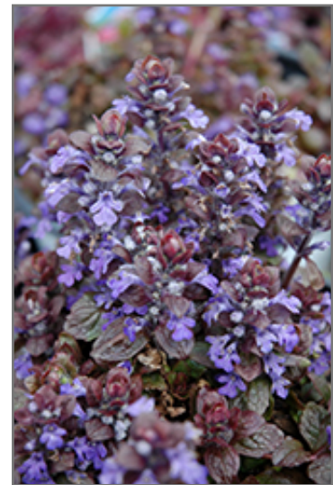
Bronze Beauty Ajuga flowers

Bronze Beauty Ajuga is recommended for the following landscape applications;