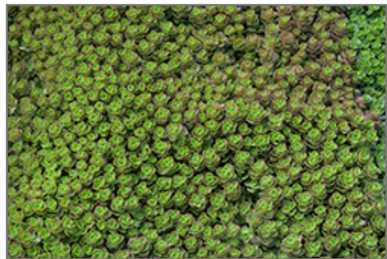
Dragon's Blood Sedum foliage