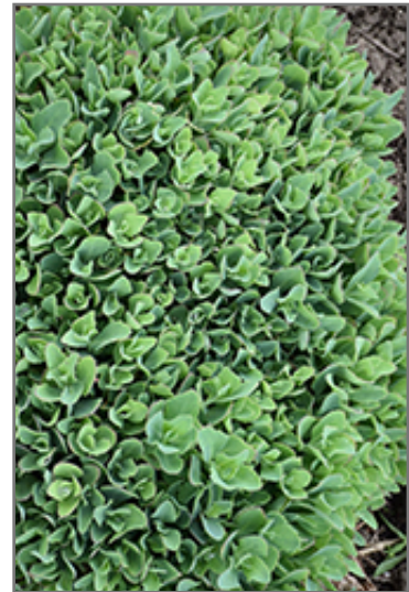
Carl Sedum foliage

Carl Sedum is a fine choice for the garden, but it is also a good selection for planting in outdoor pots and containers. It is often used as a 'filler' in the 'spiller-thriller-filler' container combination, providing a mass of flowers and foliage against which the larger thriller plants stand out. Note that when growing plants in outdoor containers and baskets, they may require more frequent waterings than they would in the yard or garden.