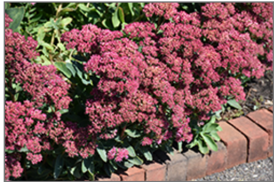
Carl Sedum in bloom

Carl Sedum is a dense herbaceous perennial with an upright spreading habit of growth. Its medium texture blends into the garden, but can always be balanced by a couple of finer or coarser plants for an effective composition.