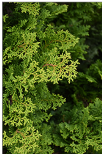
Tempelhof Falsecypress foliage