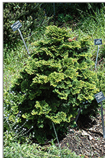
Tempelhof Falsecypress