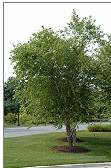
River Birch (clump)

River Birch (clump) will grow to be about 40 feet tall at maturity, with a spread of 40 feet. It has a low canopy with a typical clearance of 3 feet from the ground, and should not be planted underneath power lines. It grows at a fast rate, and under ideal conditions can be expected to live for 70 years or more.