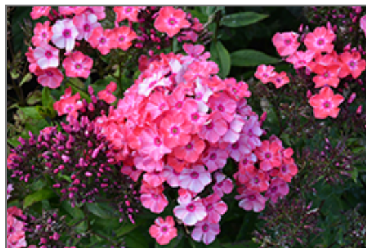
Garden Girls Glamour Girl Garden Phlox flowers

Garden Girls Glamour Girl Garden Phlox is recommended for the following landscape applications;