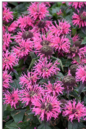
Bubblegum Blast Beebalm flowers