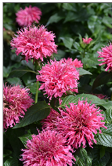
Bubblegum Blast Beebalm flowers