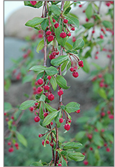
Louisa Weeping Crabapple flower buds

This tree should only be grown in full sunlight. It prefers to grow in average to moist conditions, and shouldn't be allowed to dry out. It is not particular as to soil type or pH. It is highly tolerant of urban pollution and will even thrive in inner city environments. This particular variety is an interspecific hybrid.