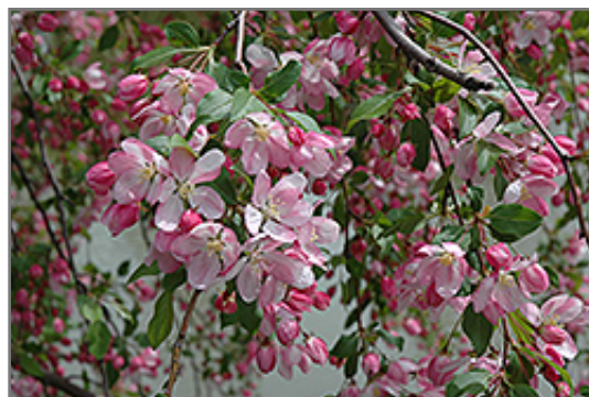
Louisa Weeping Crabapple flowers