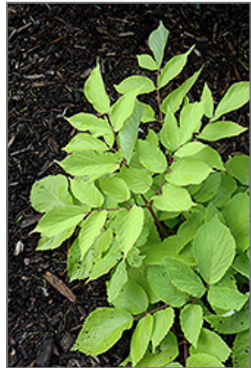
Sun King Aralia foliage

This plant performs well in both full sun and full shade. It prefers to grow in average to moist conditions, and shouldn't be allowed to dry out. It is not particular as to soil type or pH. It is highly tolerant of urban pollution and will even thrive in inner city environments. This is a selected variety of a species not originally from North America.