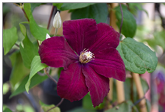
Rouge Cardinal Clematis flowers