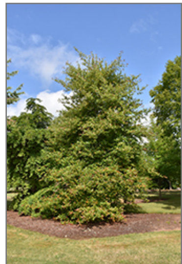
Wildfire Black Gum