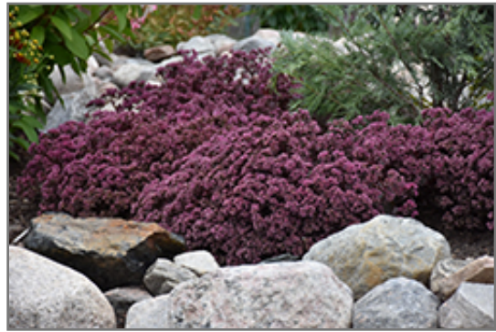
Cherry Tart Sedum in bloom

Cherry Tart Sedum is a dense herbaceous perennial with an upright spreading habit of growth. Its medium texture blends into the garden, but can always be balanced by a couple of finer or coarser plants for an effective composition.