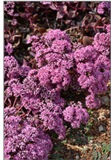
Cherry Tart Sedum flowers

Cherry Tart Sedum is a fine choice for the garden, but it is also a good selection for planting in outdoor pots and containers. It is often used as a 'filler' in the 'spiller-thriller-filler' container combination, providing a mass of flowers and foliage against which the larger thriller plants stand out. Note that when growing plants in outdoor containers and baskets, they may require more frequent waterings than they would in the yard or garden.