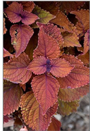
Wall Street Coleus foliage