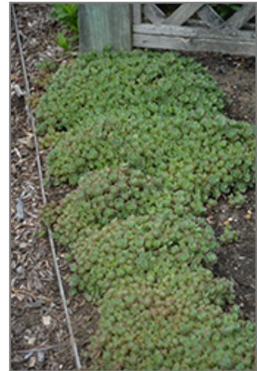
Lime Zinger Sedum

Lime Zinger Sedum is a fine choice for the garden, but it is also a good selection for planting in outdoor pots and containers. Because of its spreading habit of growth, it is ideally suited for use as a 'spiller' in the 'spiller-thriller-filler' container combination; plant it near the edges where it can spill gracefully over the pot. Note that when growing plants in outdoor containers and baskets, they may require more frequent waterings than they would in the yard or garden.