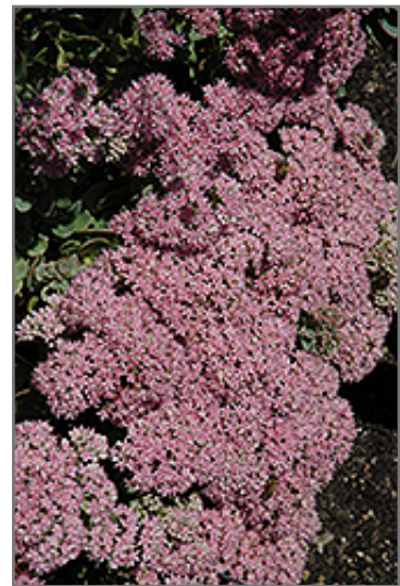
Lime Zinger Sedum flowers

Lime Zinger Sedum is recommended for the following landscape applications;