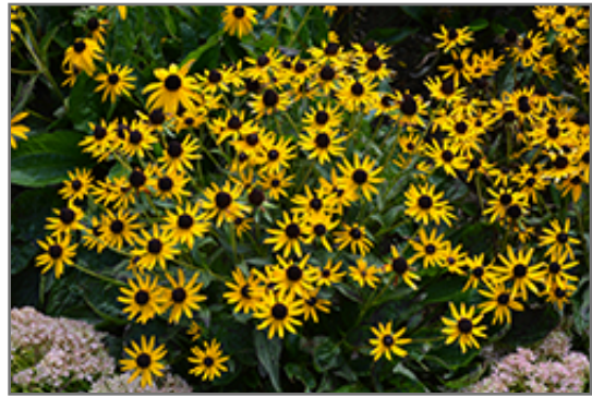
Little Goldstar Black-Eyed Susan in bloom

Little Goldstar Black-Eyed Susan is recommended for the following landscape applications;