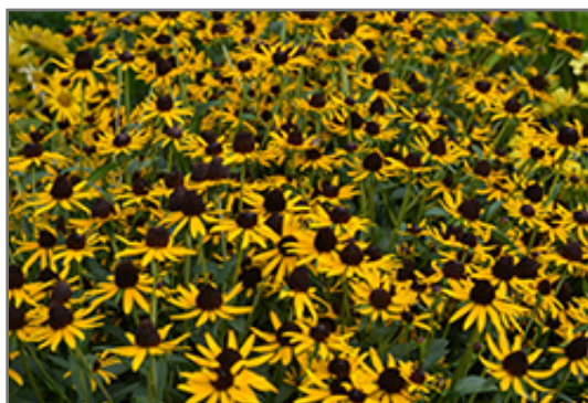
Little Goldstar Black-Eyed Susan flowers