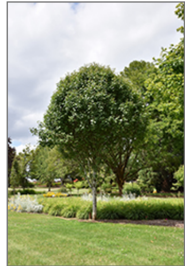
Jack Ornamental Pear

This tree should only be grown in full sunlight. It prefers to grow in average to moist conditions, and shouldn't be allowed to dry out. It is not particular as to soil type or pH. It is highly tolerant of urban pollution and will even thrive in inner city environments. This is a selected variety of a species not originally from North America.