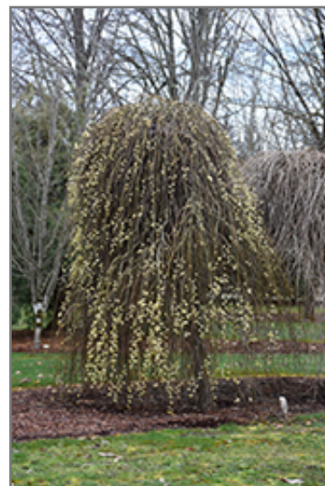
Weeping Pussy Willow on Std. in bloom