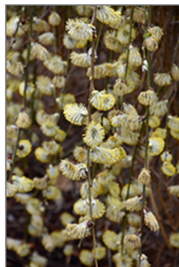
Weeping Pussy Willow on Std. flowers