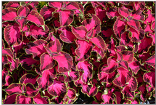
Chocolate Covered Cherry Coleus foliage

* This is a 'special order' plant - contact store for details