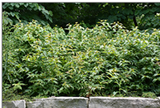
Dwarf Bush Honeysuckle

Dwarf Bush Honeysuckle is recommended for the following landscape applications;