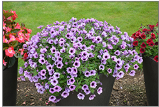
Supertunia Bordeaux Petunia in bloom

Supertunia Bordeaux Petunia is a fine choice for the garden, but it is also a good selection for planting in outdoor containers and hanging baskets. Because of its trailing habit of growth, it is ideally suited for use as a 'spiller' in the 'spiller-thriller-filler' container combination; plant it near the edges where it can spill gracefully over the pot. Note that when growing plants in outdoor containers and baskets, they may require more frequent waterings than they would in the yard or garden.