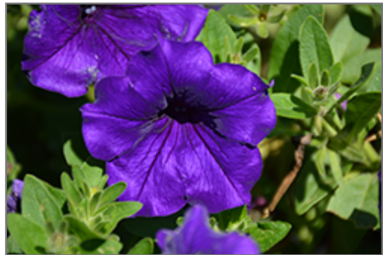
Easy Wave Blue Petunia flowers